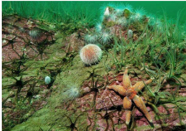
Wildlife and Countryside Link