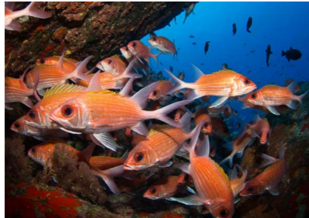
Ascension Island © Jude Brown