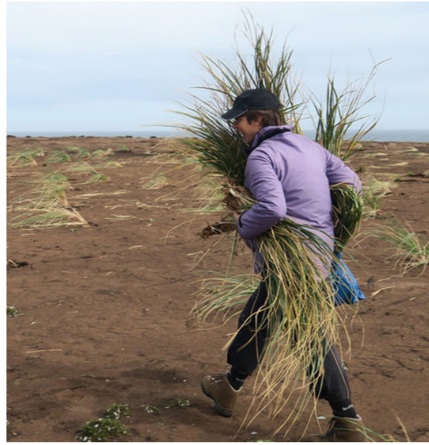
Falklands Conservation tussac planting

We believe that a healthy environment is essential to the wellbeing and resilience of people and nature. Our aim is to achieve greater harmony between people and nature, through the protection, restoration and sustainable use of the natural world. We are interested in organisations that understand the interdependence of people and nature and apply this in their thinking and practice. Often, it is the system that has to change, so we will also support those working to influence governments, businesses, financial and economic systems, and civil society through policy, advocacy and campaigning work.