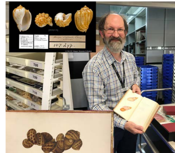
National Museum Wales