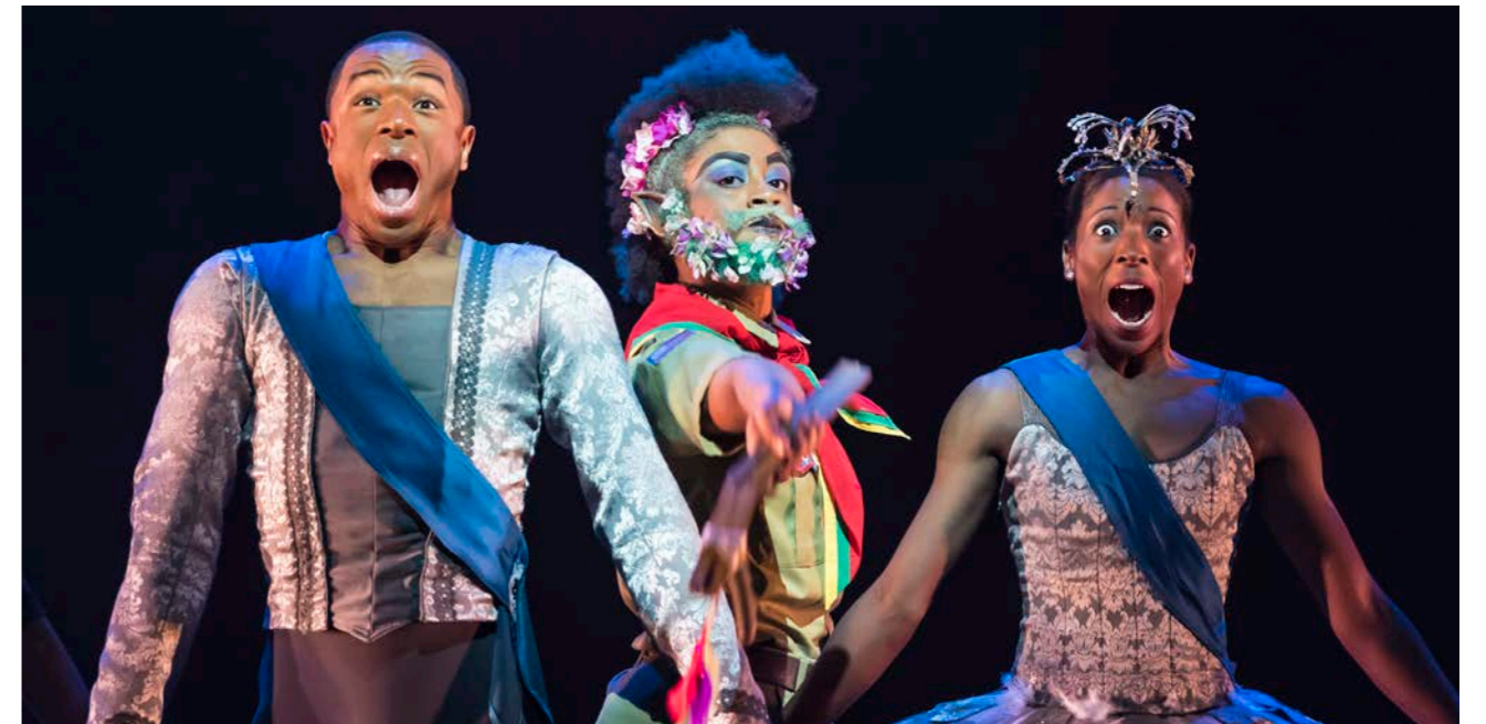
Ballet Black: Dream