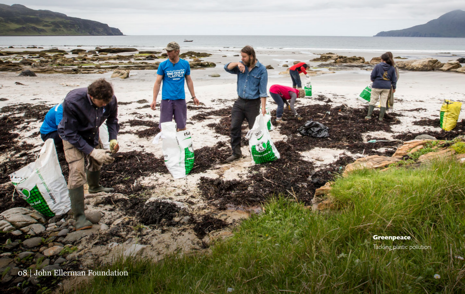
Greenpeace Tackling plastic pollution

The full details of what we will fund are available on our website and in our funding guidelines document. The information we share on our website and in our funding guidelines is reviewed on an ongoing basis, with a full review of the funding guidelines carried out at least once per year – usually in August and September. Our three funding categories and our aims for each of these are as follows: