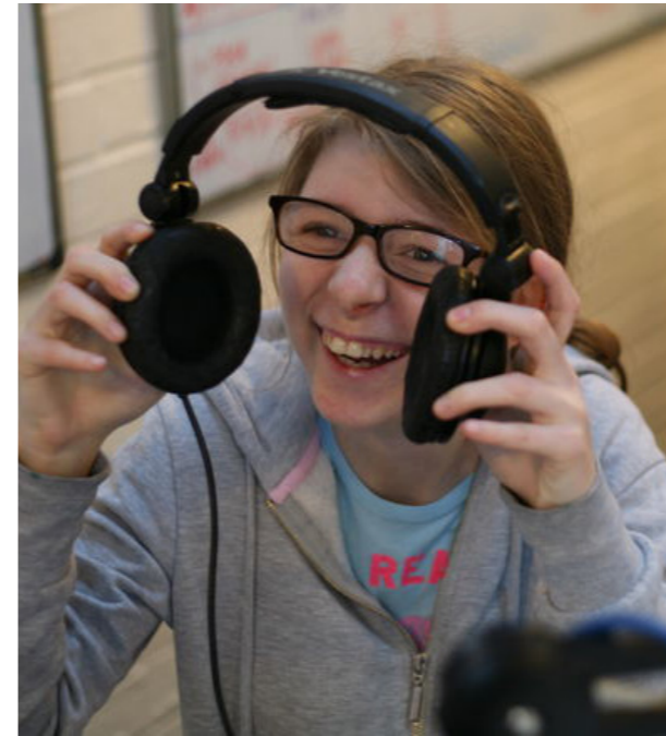
Heart n Soul

We aim to help create an inclusive society where all can thrive, by supporting organisations which work to create positive changes at a systems-wide level benefitting wider society. We believe it is people working together who create change. We are interested in organisations with a track record that tackle divisions and inequity, and who bring together individuals, community organisations and others, including national bodies, to influence government and the agencies that shape our lives.