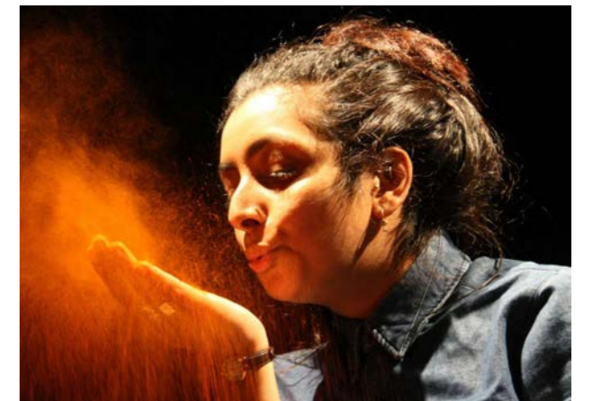
SICK! Festival – Daughters of the Curry Revolution