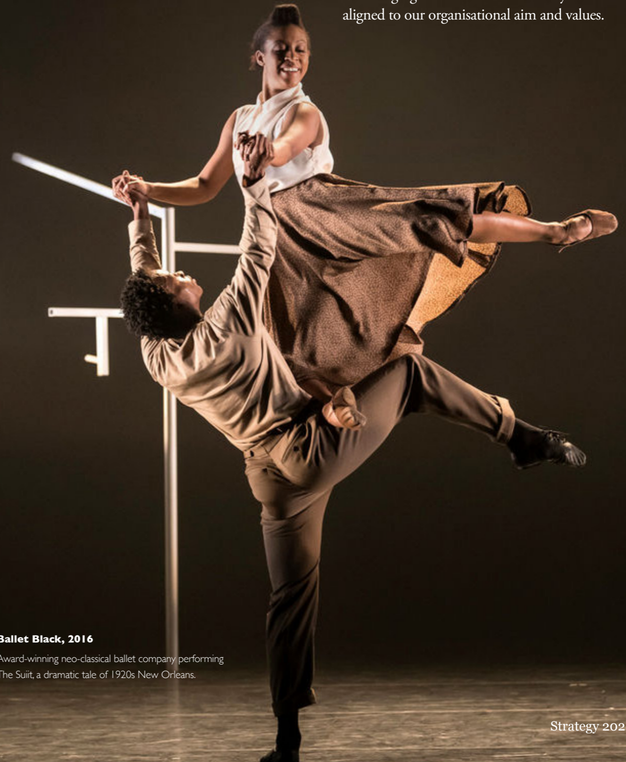
Ballet Black, 2016

Philanthropy has the privilege of being able to support work that tries to address structural and systemic inequities and barriers that result in a loss or lack of wellbeing for people, society and the natural world. We demonstrate our commitment to advancing wellbeing in two ways – firstly through our grantmaking in support of the arts, social action and the environment, and secondly, our commitment to managing our endowment in a way that is well aligned to our organisational aim and values.