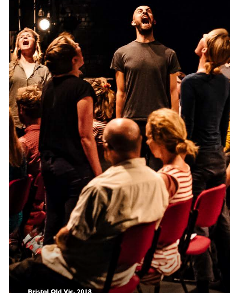
Bristol Old Vic, 2018

“ We have used the changes we made to our grantmaking as a result of the Covid-19 pandemic in 2020 and 2021 to review in more detail our approach to risk, and to offer more support to organisations we fund in the first year of their grant with us ”