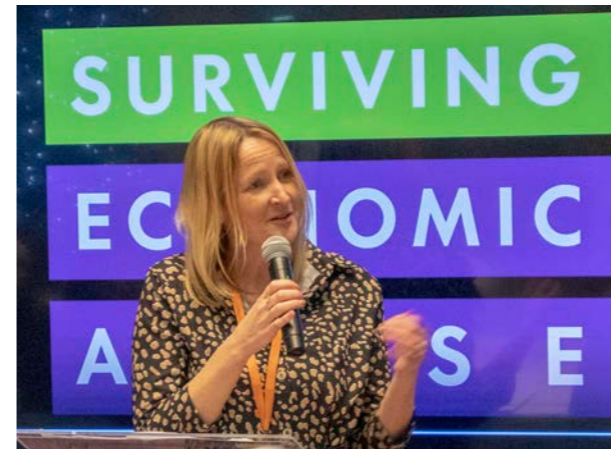
Surviving Economic Abuse