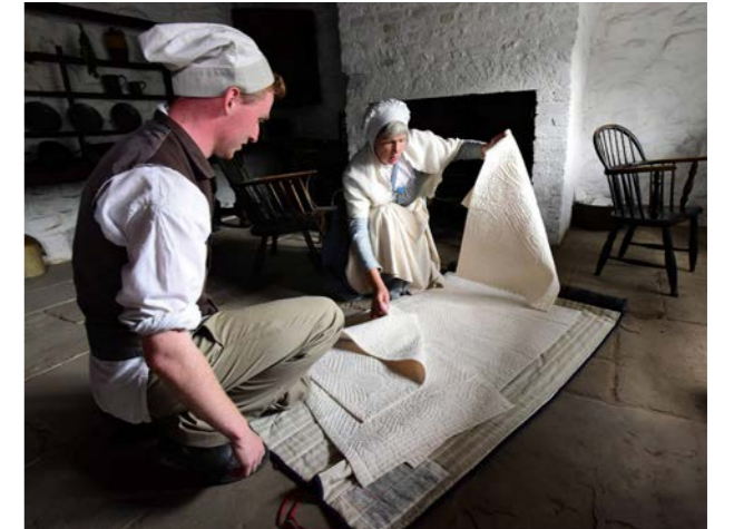
Beamish, the Living Museum of the North

We believe arts and culture have the potential to enrich and transform lives, and we recognise its inherent value and unique effects. We will fund organisations that nurture, incubate and commission those people who make and curate work.