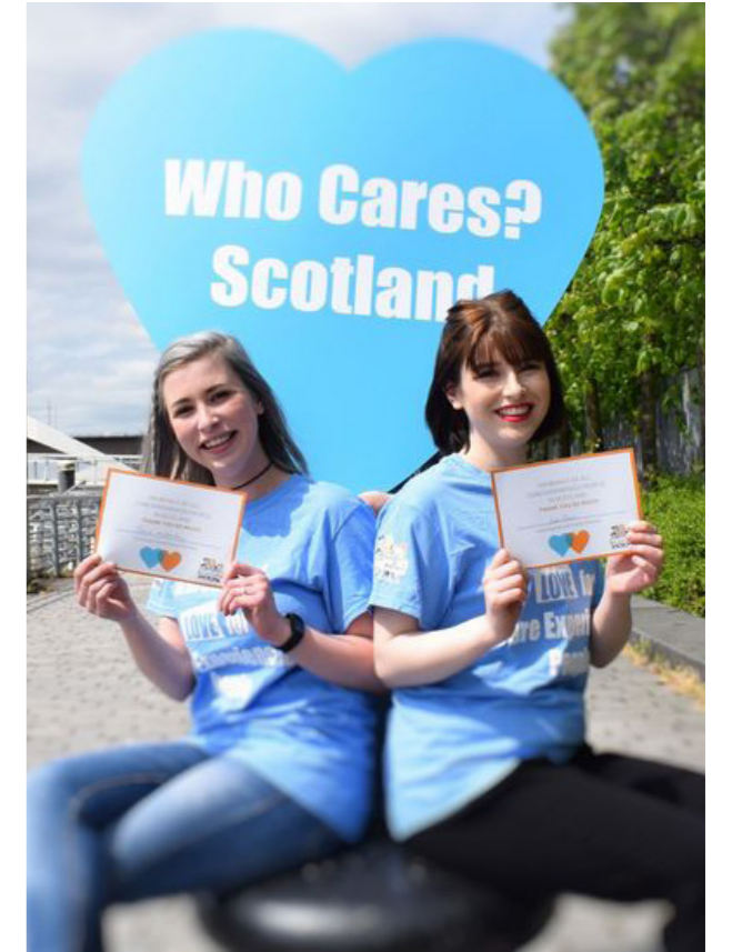
Who Cares Scotland

We aim to help create an inclusive society where all can thrive, by supporting organisations which work to create positive changes at a systems-wide level benefitting wider society. We believe it is people working together who create change. We are interested in organisations with a track record that tackle divisions and inequity, and who bring together individuals, community organisations and others, including national bodies, to influence government and the agencies that shape our lives.